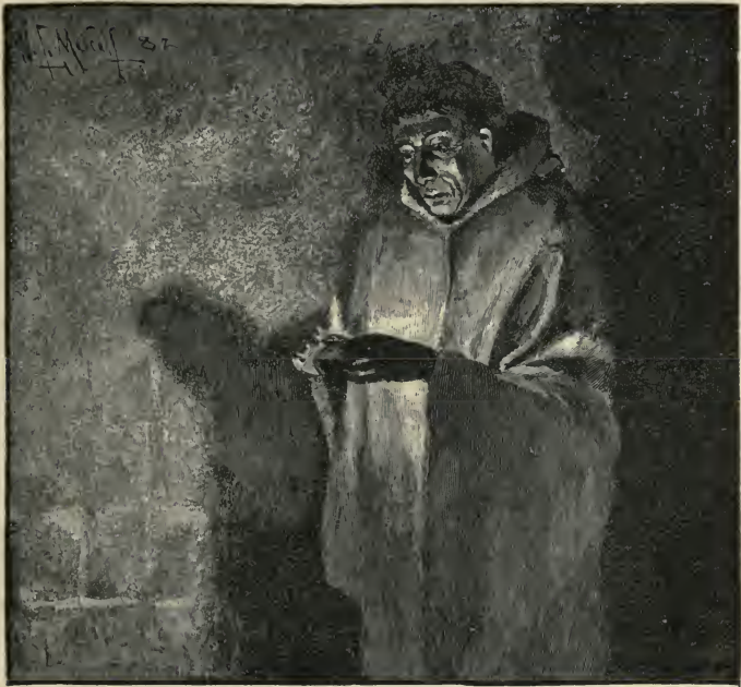
"FRIAR JEROME." Page 82.